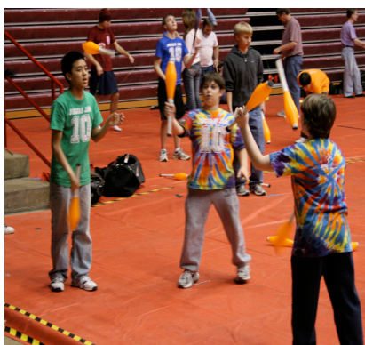
19 Jugheads enjoyed a juggling weekend at Mad-Fest in Madison, WI, January 16-18.

compassion. My teacher told the class to describe a place or a person who demonstrates compassion. So I took a big step back and imagined the perfect community of compassion. I thought of leaders that all cared about all the individuals' best interest. I also thought of others following the example of the leaders. They encouraged each other when someone had a hard time, and they congratulated each other when they did well. Some others